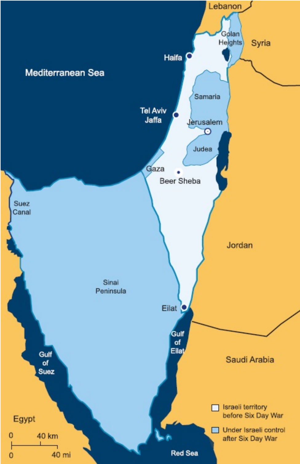
Map 4: Israel after the Six-day War (June 10, 1967)