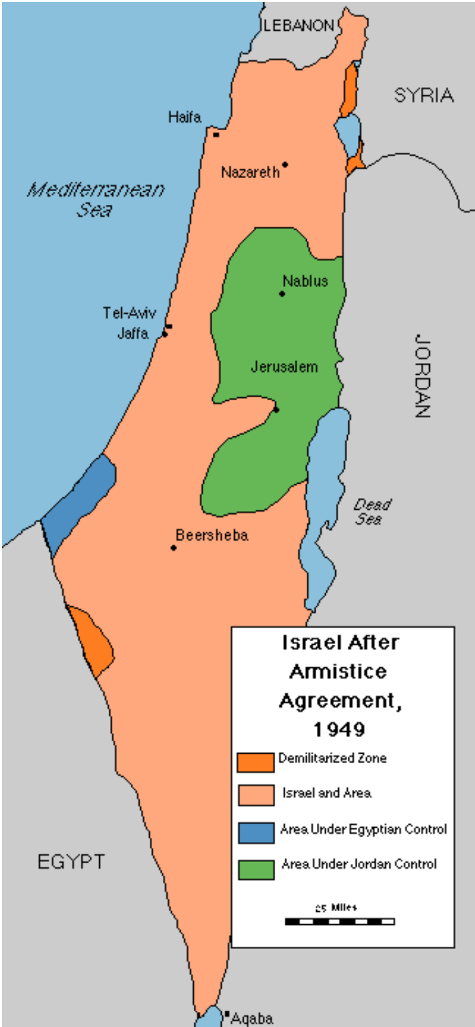
Map 3: Israel after the 1949 Armistice Agreement