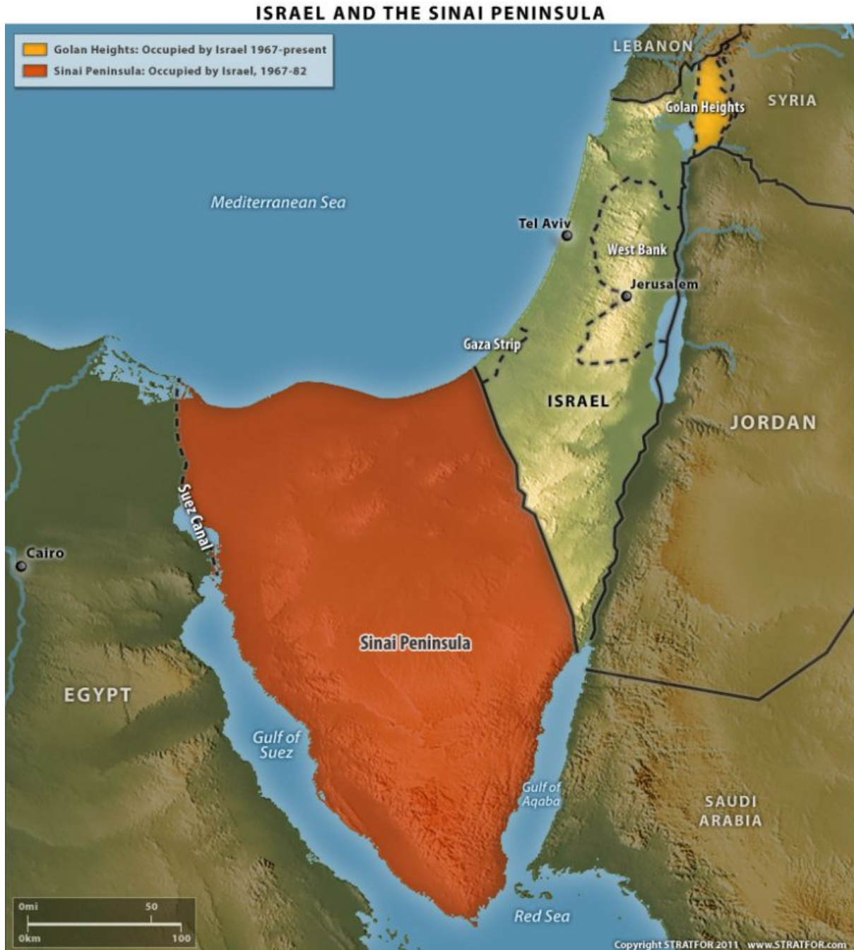
Map 5: Israel after the peace treaty with Egypt (1982)