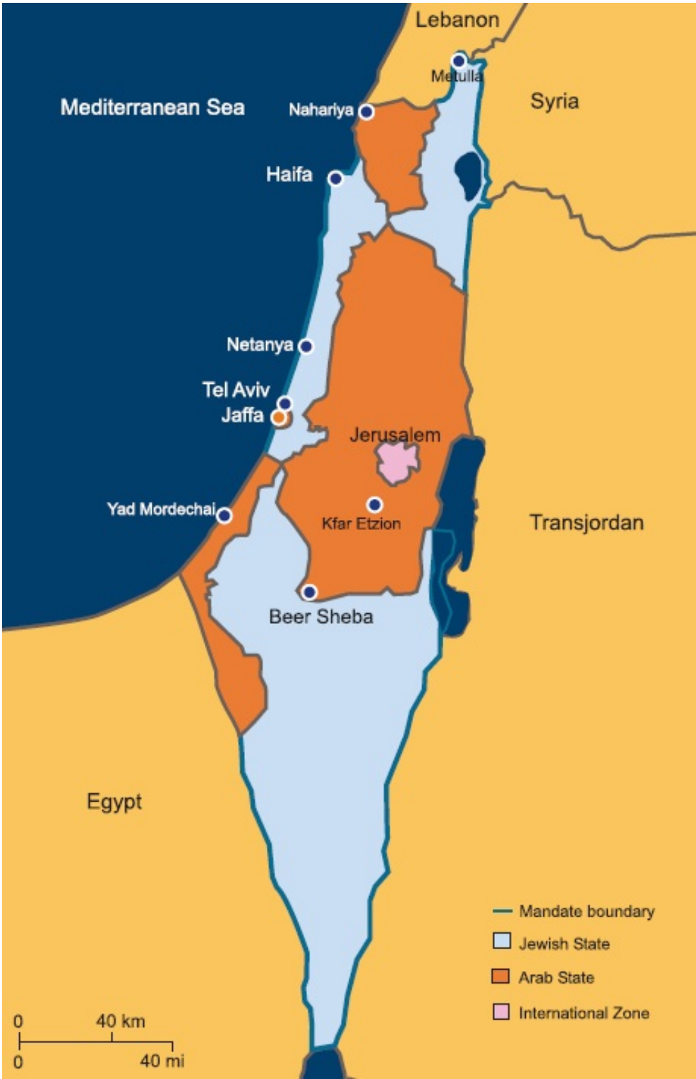
Map 2: The Partition Plan (1947)